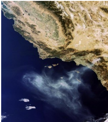
Figure 1. -- Envisat satellite --

The detection systems of wildfires through images collected by satellites are the most novel. Both NASA and the European Space Agency are using this technology in their detection projects.