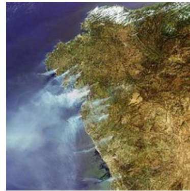
Figure 2.-- Envisat satellite --

Figure 1 taken by Envisat satellite. The image corresponds to a forest fire occurred in California.